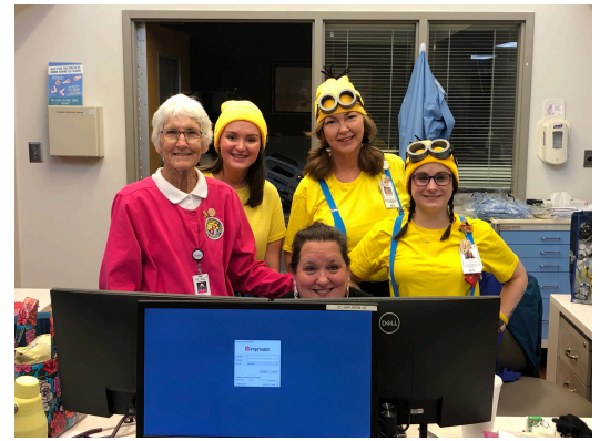
A little late: Happy Halloween from the cute Minions in the Cancer Center!