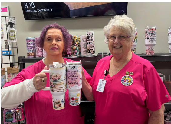
Helping at vendor sales can be lots of fun!